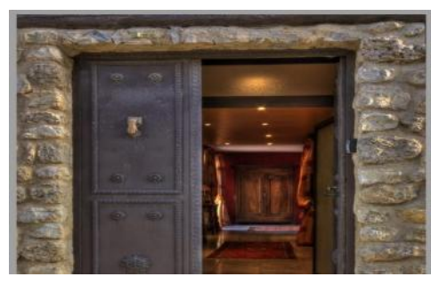
View of the main entrance of Villa Donna. Very classically decorated!