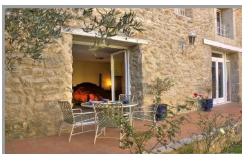
Unlike other houses, the garden at Villa Donna is in the center of the house! Here is a view of the house surrounding the garden, each room on the bottom floor has French windows opening out onto this gorgeous garden.