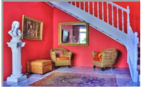
As you can see, Villa Donna is beautifully decorated with magnificent pieces of art and furniture all around the villa.