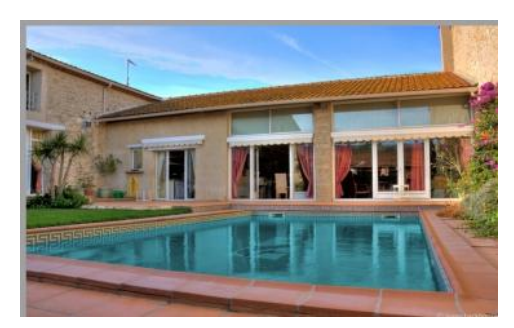
Another view of the beautiful and refreshing swimming pool in Villa Donna. What better way to cool down, than to go swimming in a gorgeous swimming pool in the sunny South of France!