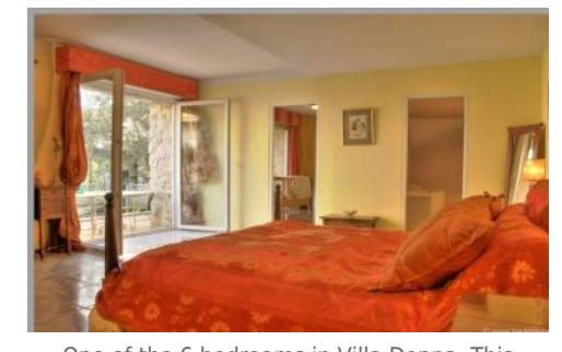
One of the 6 bedrooms in Villa Donna. This bedroom is very spacious and beautifully decorated with bright colours to make you feel at home.