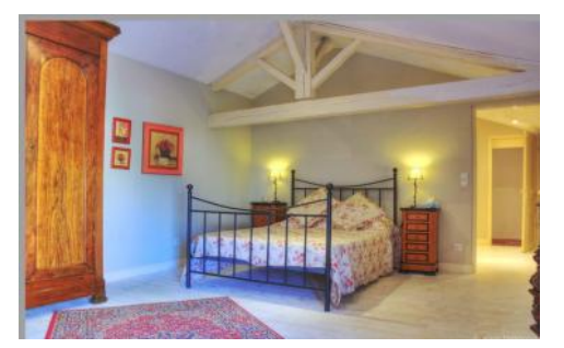
Another of the 6 bedrooms in Villa Donna. This room is very wide and spacious, it comes with a wardrobe, bedside tables and is decorated in a simple manner, offering as much space as possible for your comfort.