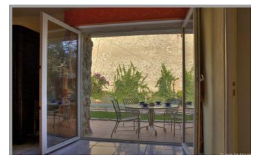
These French windows in Villa Donna, open out onto an outside dining area, as well as the garden and swimming pool.