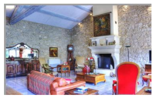
A closer view of the lounge area, complete with comfortable sofas and chairs and an open fireplace.