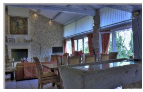
View of the artsy bar seperating the kitchen and dining room. The dining table is situated between the lounge area and kitchen.