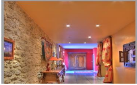
Here's a view of the very beautiful inside of Villa Donna. If you like this photo, then you'll love the rest of this villa as the whole place is decorated as such!