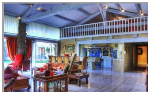
Here is a wide view of the lounge area, dining area, kitchen and mezzanine. Everything is in the same room, offering you easier access to all of these amenities.