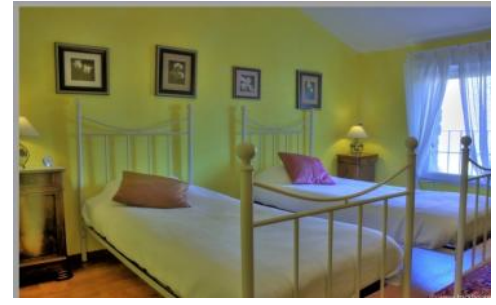
Here is a view of the twin bedroom in Villa Donna. It is very cosy thanks to the decor and is a spacious room.