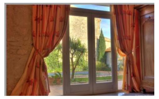
Here a view that can be seen from one of the 6 bedrooms. These French windows open up onto the garden and swimming pool.