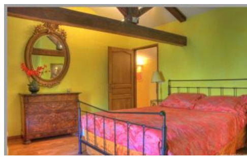
This bedroom in Villa Donna is absolutely beautiful. The lighting and decor in this room, gives a warm feeling and makes you feel right at home!