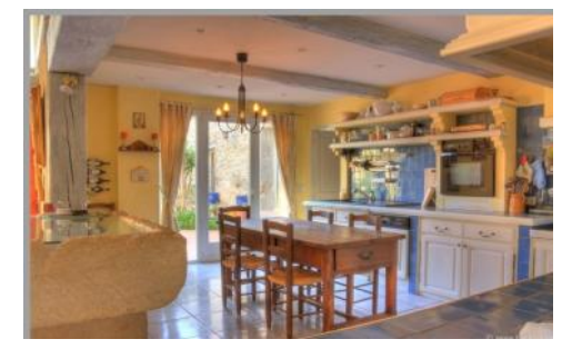
A closer view of the fully equipped and beautifully decorated kitchen in Villa Donna.