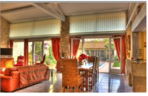
The lounge area and dining area in Villa Donna.