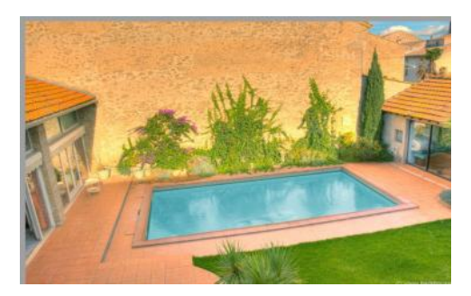
Villa Donna in Nissan Lez Enserune has a fantastic private swimming pool, where you can relax and sunbathe!