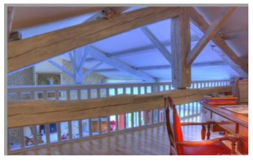
The office area in Villa Donna is in a mezzanine area. This mezzanine offers you privacy and calm but also offers a view onto the lounge down below.