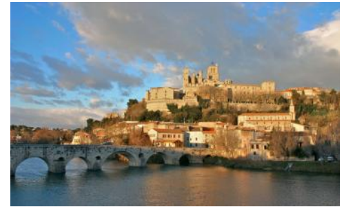
Beziers, 15 minutes away