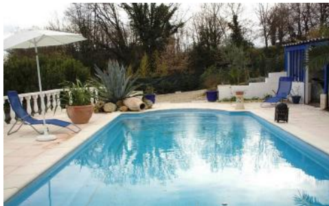
Pool and terrace