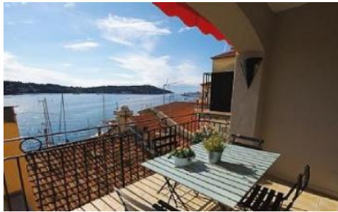
L'Artistes Tresor Superb Sea view 2