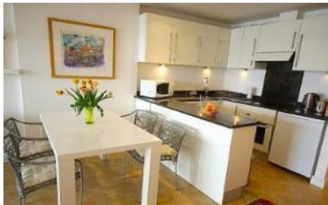
L'Artistes Tresor kitchen