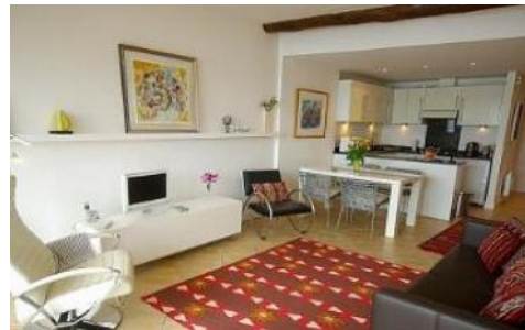
L'Artistes Tresor Living room