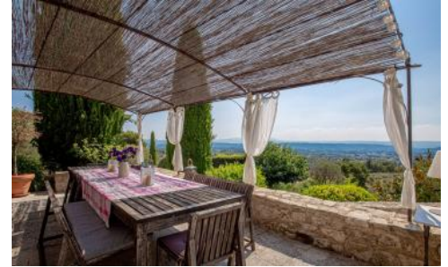
Dining area outside