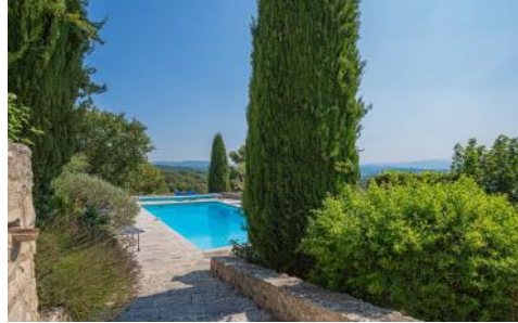
Terrace to pool