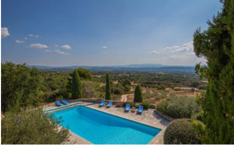
Pool with view