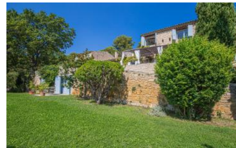
Outside apartment to upstairs