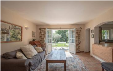
Apartment sitting room