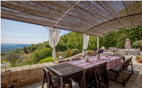
Outside dining area