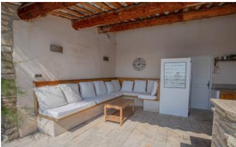
poolhouse seating area