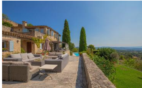
Terrace and view