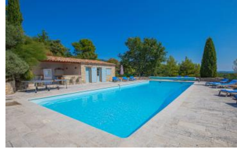
Pool and poolhouse