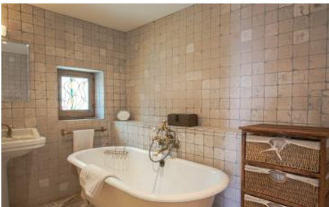
Bedroom 2 ensuite