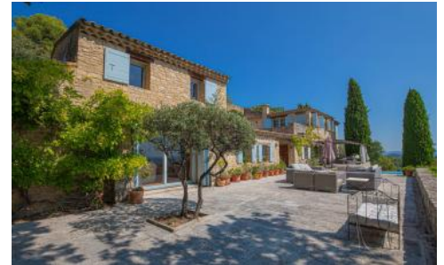
house and terrace