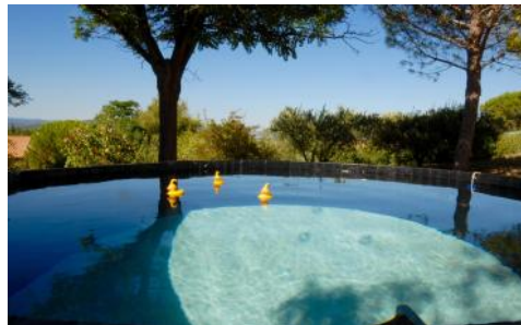
join the ducks