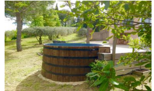
Plunge pool and olive trees