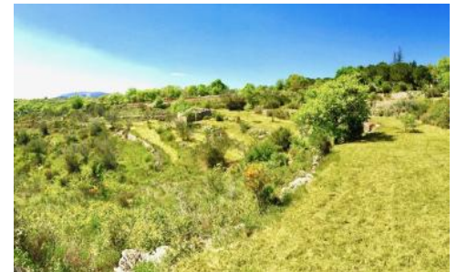
Land to shepherds hut and treehouse