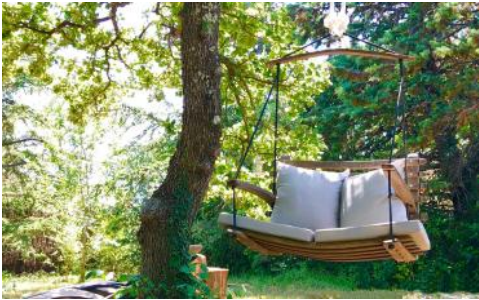
Guest house garden swing