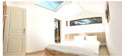
Guest house duple bedroom