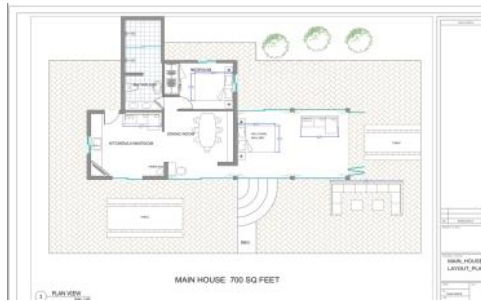
Main house layout