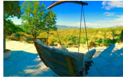
Main house swing chair