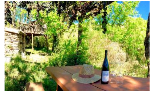
Treehouse dinning aria