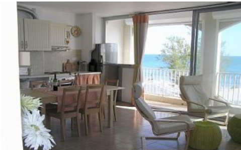
Here is an overall view of Seaview Apartment's kitchen, living room and dining room, with of course the beautiful view of the sea.