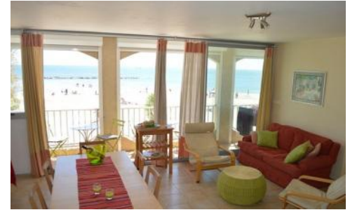
Seaview Apartment - the name says it all! Here is the beautiful view that you'll be seeing from this wonderful apartment.