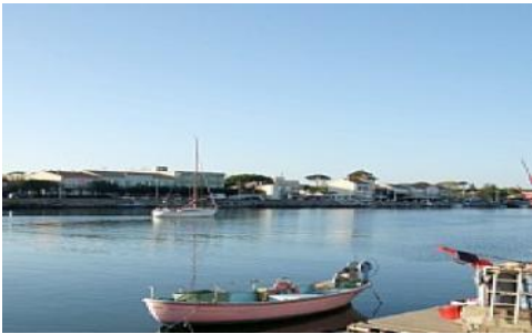
Another view of what you can see every day at Seaview Apartment.