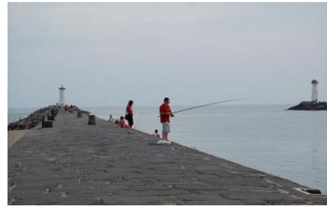
Fishing in Grau d'Agde!