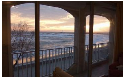
Here is Seaview Apartment's balcony, complete with 2 small tables and chairs, and a BBQ. This really is an amazing place to just sit back and enjoy the beautiful view.