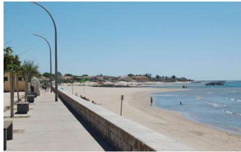
Here is the wonderful beach at Grau d'Agde!