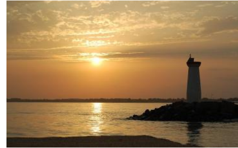
Seaview Apartment - the name says it all! Here is the beautiful view that you'll be seeing from this wonderful apartment.