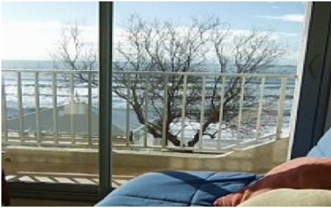
This pull-out couch can be used as a third bed in Seaview Apartment!