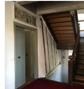
First floor landing