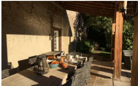
Breakfast on the covered terrace