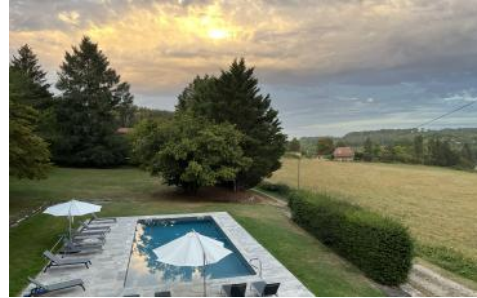
Swimming pool overlooking the meadow