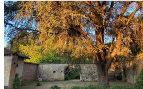
Very pleasant shady place in the courtyard