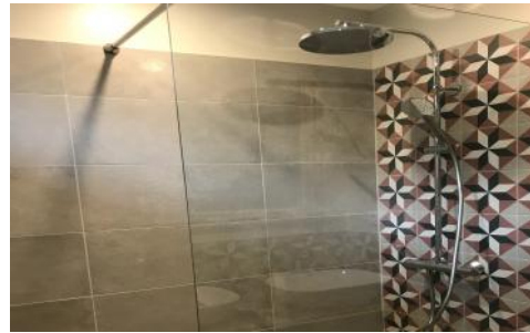
Shower on the first floor