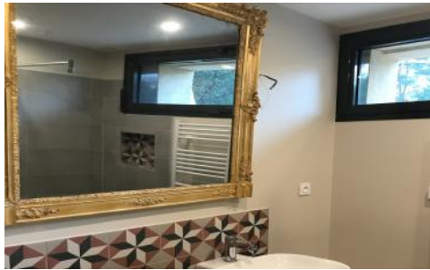
Bathroom on the first floor