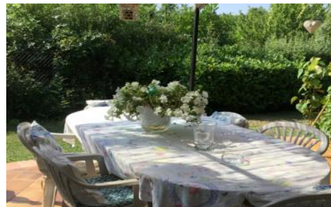
Kitchen terrace sofa breakfast table