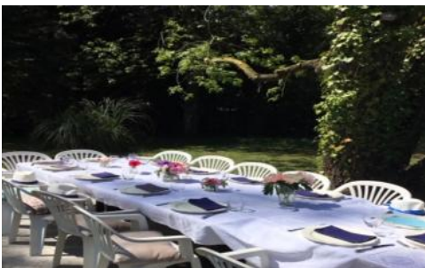
dining in the garden