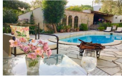
Rose wine by the pool watching sunset