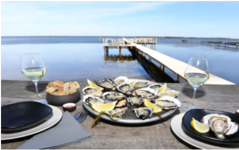
Oysters at Tarbouriech