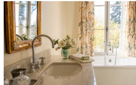
Bathroom overlooks courtyard