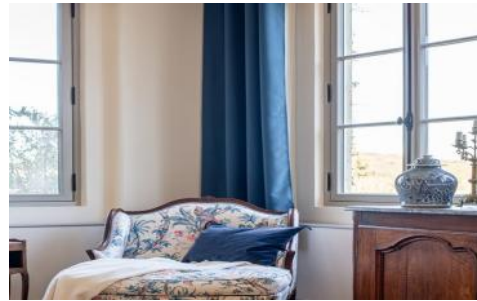
18th c. Duchess brisée