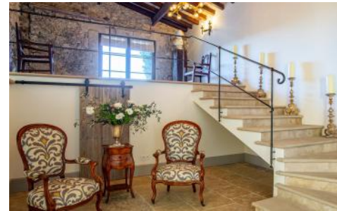
Stairs to Principal Bedroom