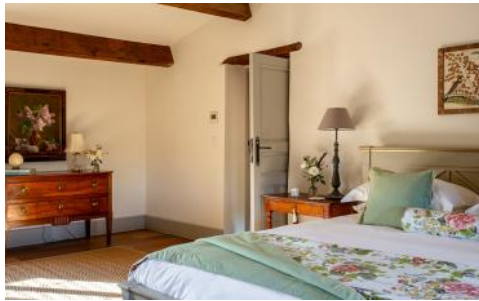
Suite 4 180cm bed