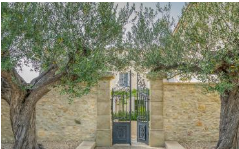
Gates to courtyard