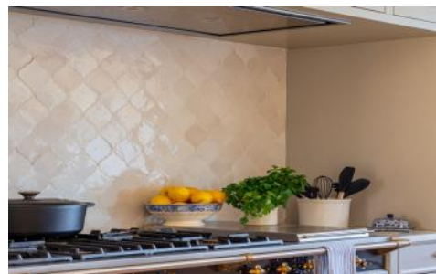
Lacanche gas cooker with electric ovens