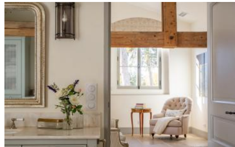
Principal bedroom from ensuite bathroom