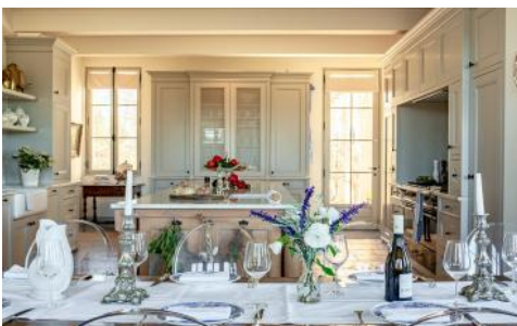
Professional style kitchen