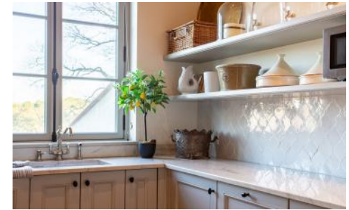
Second fully equipped kitchen