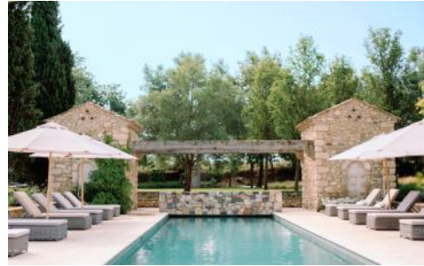
17m saltwater pool