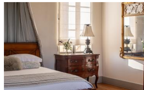
Views to garden and countryside