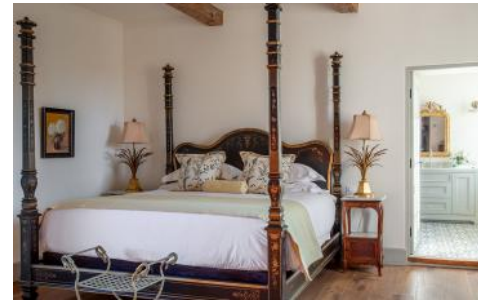
Suite 2 200cm 4-poster bed