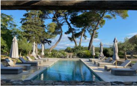
Pool with a view