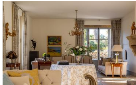
Le Grand Salon