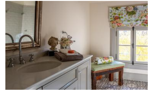
Bathroom with views to courtyard