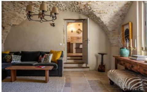
Petit salon can be converted to ground floor bedroom