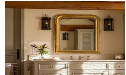
Double sinks in Principal bathroom