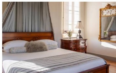
180cm canopy bed