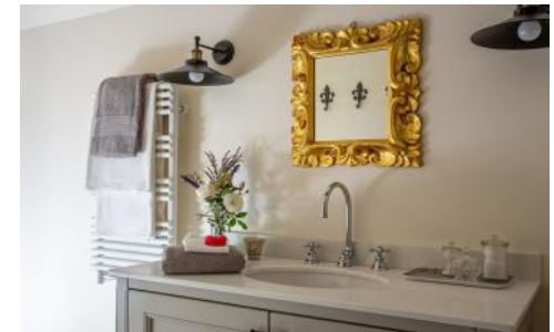
Towel warmers in all bathrooms