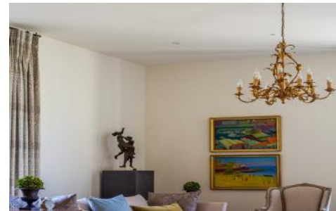
Multiple seating areas