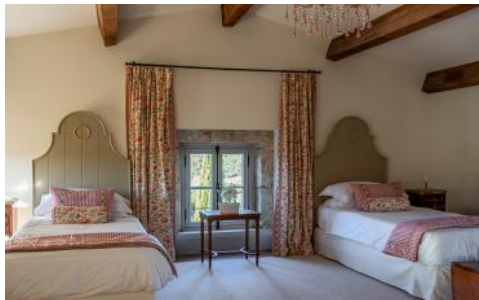
Suite 5 2x 90cm single beds