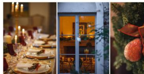
Christmas in the South of France