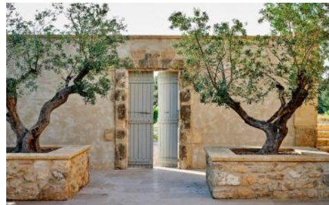
Gates to vineyard