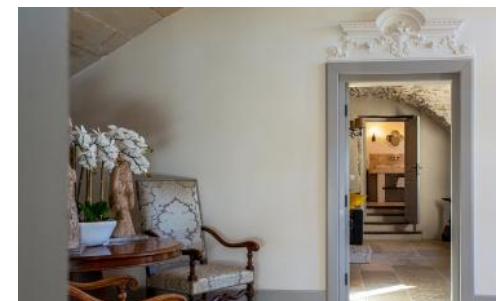
Entry hall to petit salon/tv