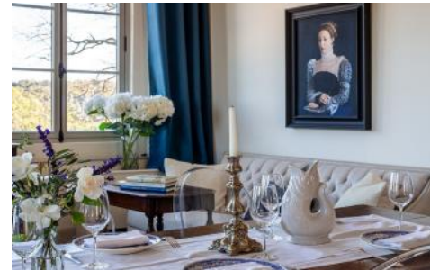
Airconditioned lounge area