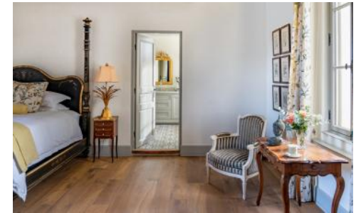
Views to garden