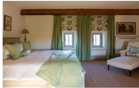
Seating in bedroom