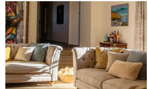
Sun-drenched grand salon