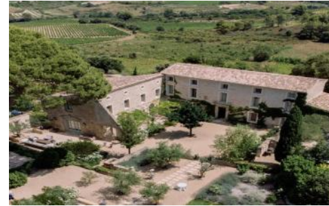
Aerial view of house