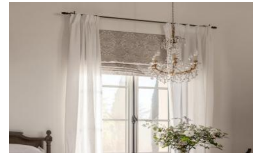
Views to garden