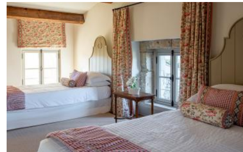
Beds can be joined to make 180cm King bed