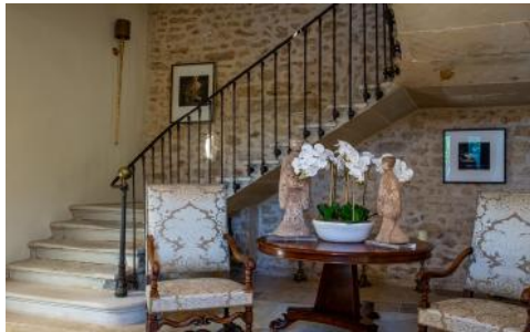
Grand staircase to four bedroom suites