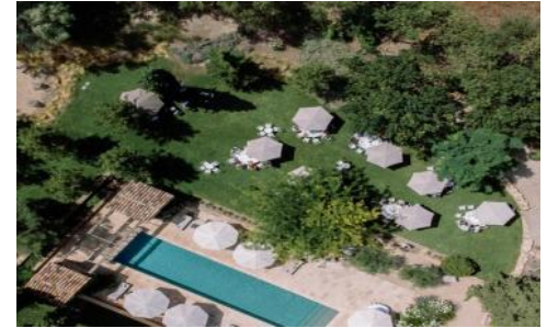
Aerial view of pool