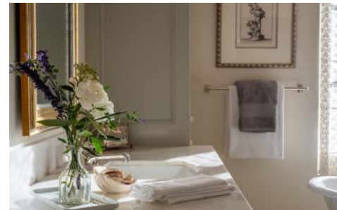
Sinks with marble counters