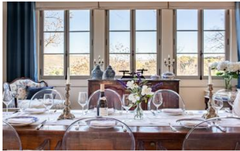
Indoor dining for ten