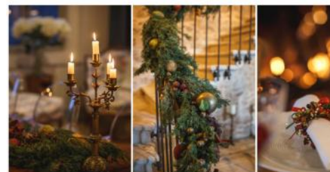
The warmth of Christmas