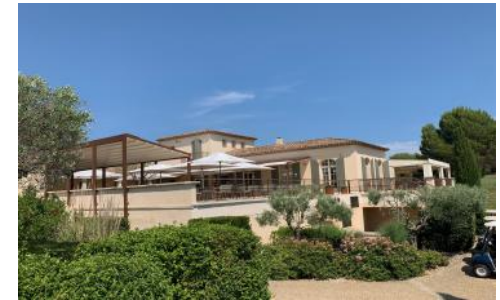
Pont Royal golf clubhouse with bar and restaurant