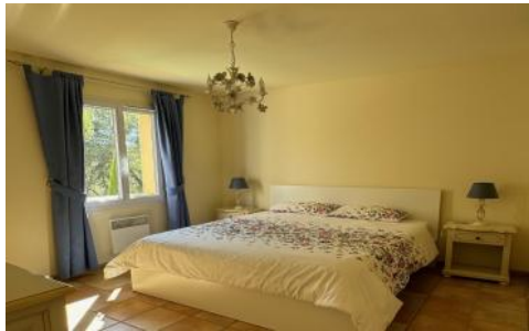
Super king size bed in master bedroom