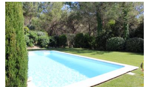
Pool is cleaned twice each week