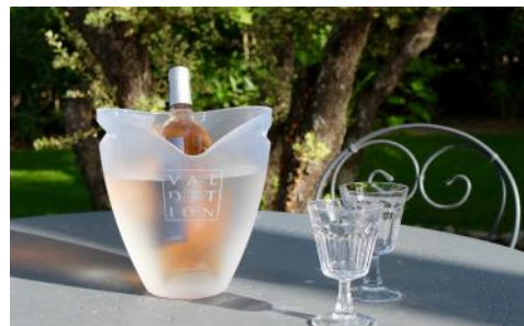
We are in the heart of rose country after all!