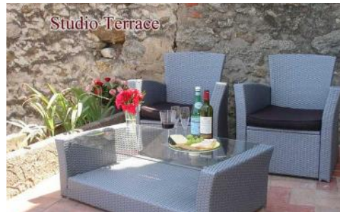
Mas D'en Porte-Studio terrace