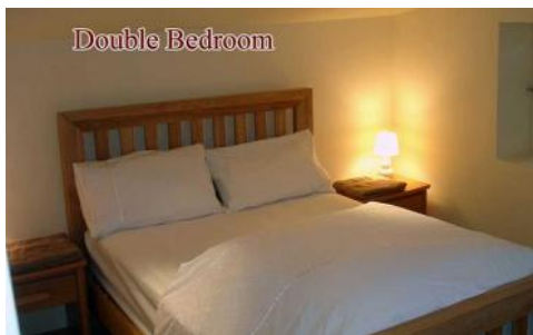
Mas D'en Porte-double bedroom 1