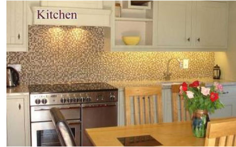
Mas D'en Porte-kitchen