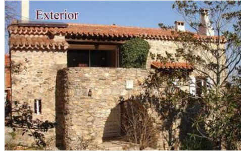
Mas D'en Porte-Exterior