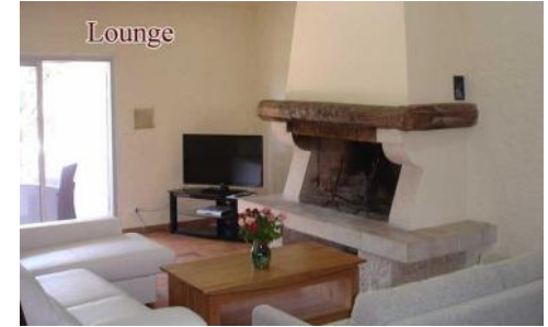
Mas D'en Porte-lounge