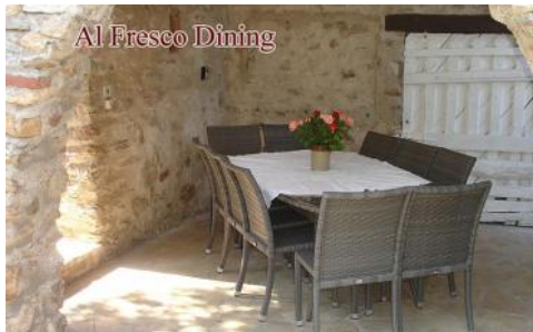
Mas D'en Porte-Exterior-Dining