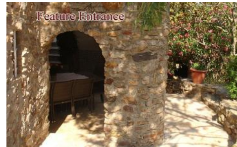
Mas D'en Porte-feature entrance