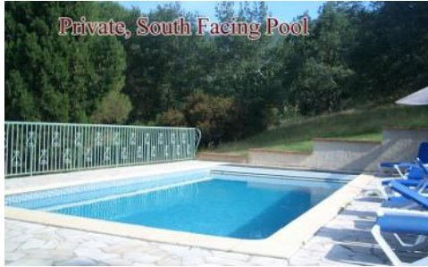
Mas D'en Porte-Pool-facing-South