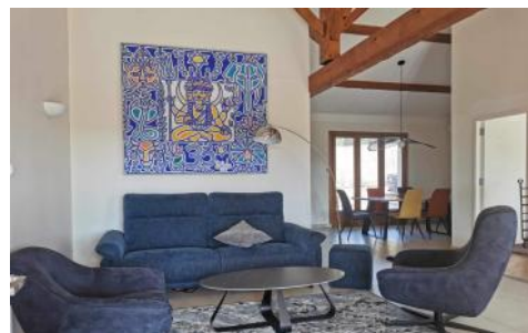
Open plan lounge / dining area