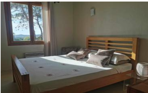
Double bedroom with garden views