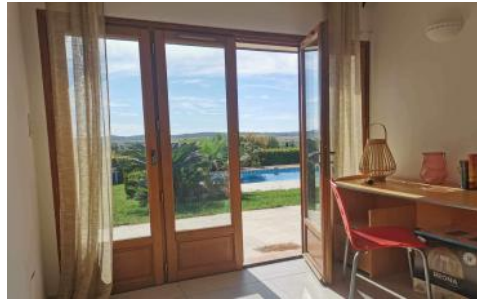
Study with access to garden