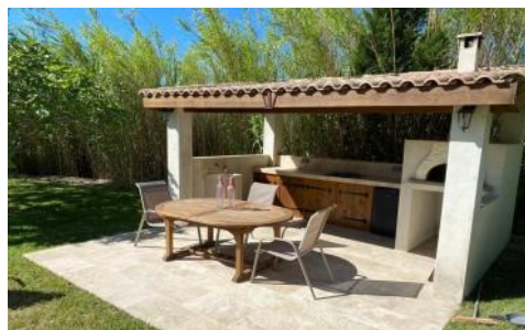
Outdoor kitchen / pizza oven