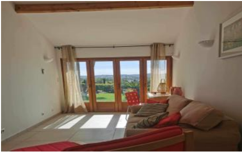
Study with garden views