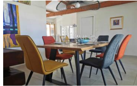
Dining table for 6