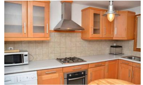
Induction hob /kitchen