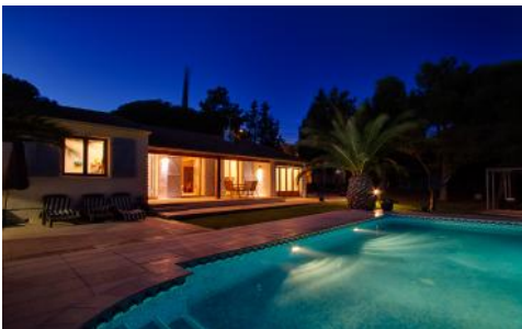
Night pool shot