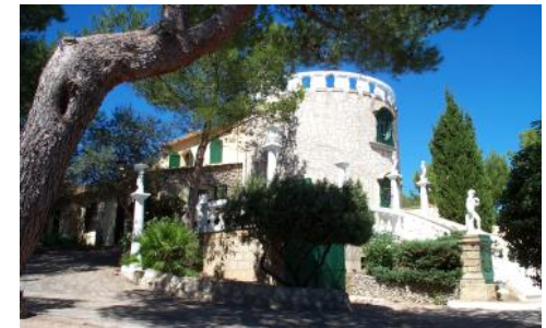
View of villa from pool