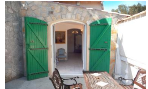
Terrace to bedroom