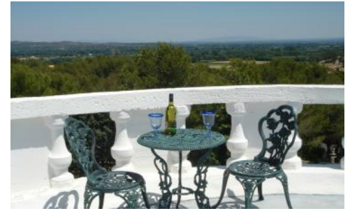
Roof top terrace