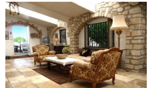
Stone entrance hall towards front door