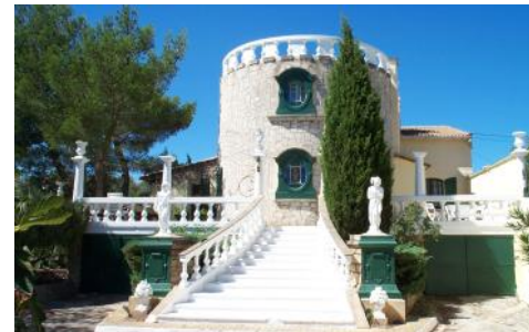
Villa from gates