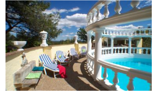
Pool sun terrace